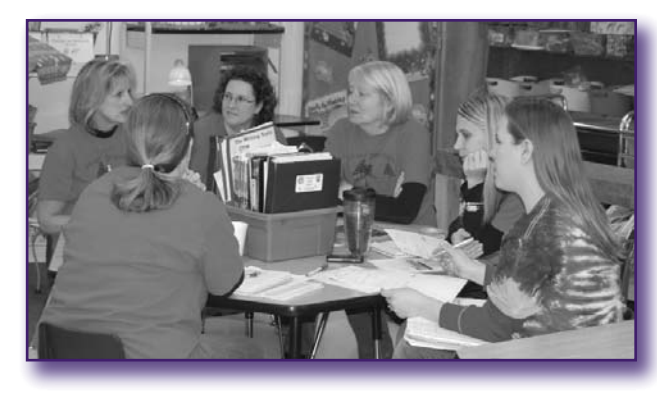
Dogwood Elementary teachers during early release collaboration